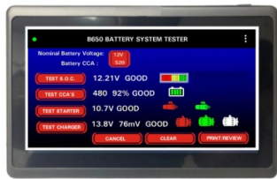
Wireless Remote 7" Tablet